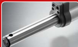
electronic limit switches with Reed contacts provide for a precise travel limitation

Last updated: 10/2013. Literal errors, errors and technical changes excepted.