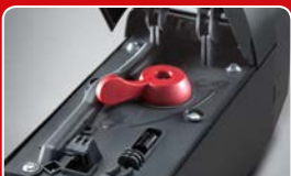
secure and convenient emergency release system