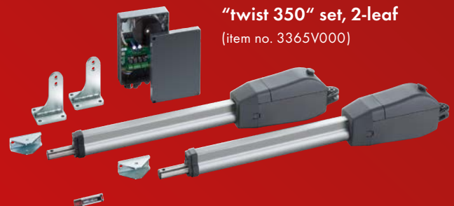
"twist 350" set, 2-leaf (item no. 3365V000)

incl. 1 swing gate operator, control board in housing, pluggable radio receiver (FM 868.8 MHz), post and gate wing bracket, 4-command transmitter (item no. 4020)