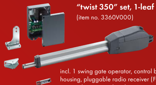
"twist 350" set, 1-leaf (item no. 3360V000)

incl. 1 swing gate operator, control board in housing, pluggable radio receiver (FM 868.8 MHz), post and gate wing bracket, 4-command transmitter (item no. 4020)