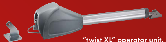
"twist XL" operator unit, 1-leaf (item no. 3280V000)