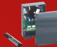
"twist XL" control unit (item no. 3282V000)