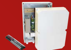
"twist XXL" control unit (item no. 3300V000)