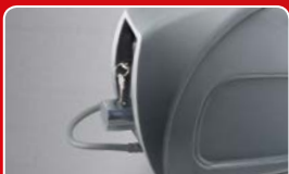
secure and convenient emergency release system